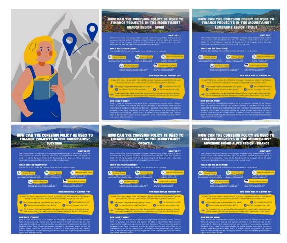
Discover how to use the new Cohesion Policy funding to make change in our 5 regions!

Whether you are a public or private entity, a company, an administration or an association, you can benefit from Cohesion Policy funds. Discover in our partners' factsheets which funds are available in the Aragon Region (Spain), Auvergne-Rhône-Alpes Region (France), Croatia, Lombardy Region (Italy) and Slovenia.