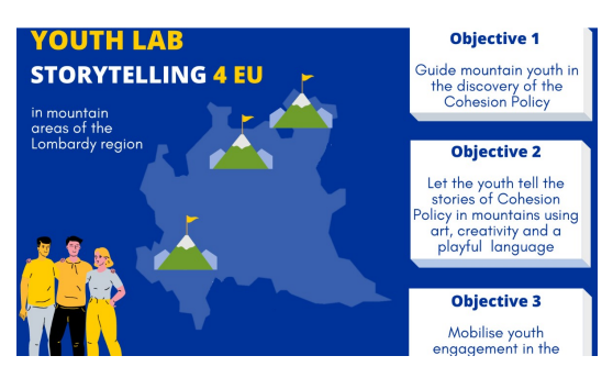
Call for participants: "Storytelling 4 EU" in Lombardy region

A call for young participants to participate to the "Storytelling 4 EU" Youth Laboratory was launched by ERSAF, partner of the Montana174 project. Tutors from the world of advertising and communication will train and guide the participants to developing their own creative artistic work. Applications can be sent until 29th April.