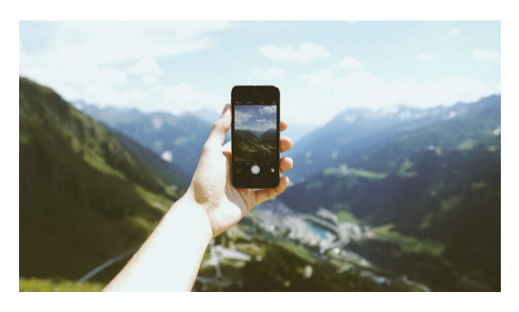
What does cohesion mean for mountain citizens?

The 8th Cohesion Report revealed that "Cohesion in the European Union has improved, but gaps remain" especially in rural regions. This report shows that in between 2014 and 2020 the cohesion funding represented 52% of the total public investments and served to finance projects to improve infrastructure, broadband connection and clean energy among others.